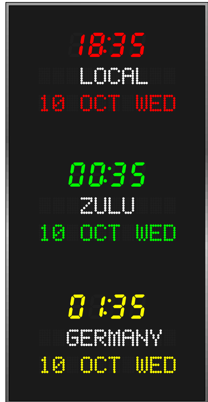
Model 3073B- 1.8" time, 1.2" zone labels, 1.2" date, 3 zones